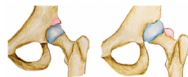
Pincer Impingement Cam Impingement

Hip pain and stiffness with running, squatting and prolonged sitting can be a sign of hip impingement. Your physiotherapist can help diagnose this and guide your treatment.